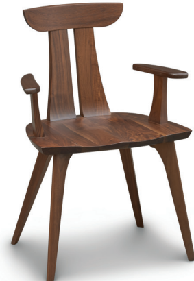
Estelle Arm Chair 8-EST-52-04