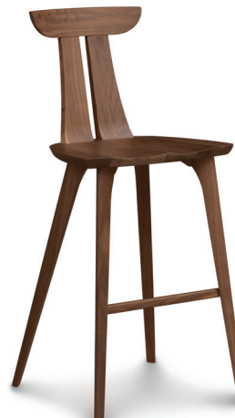
Estelle Bar Stool - seat height 30" 8-EST-65-04