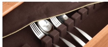
The silverware drawer is fitted with an anti-tarnish insert.