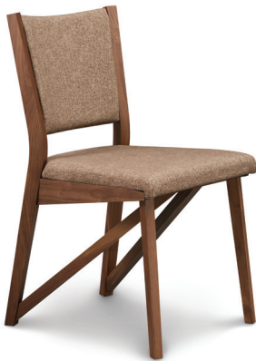
Exeter Chair 8-ESE-50-XX