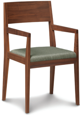
Kyoto Armchair 8-KYO-42-04