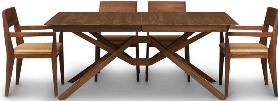
Extension Table with 2 leaves