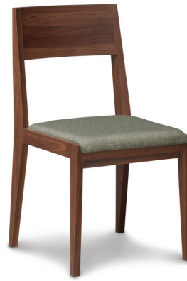
Kyoto Sidechair 8-KYO-40-04