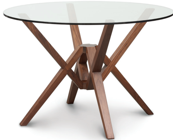
54" Round Glass Top Table 6-EXE-35-04 54"w x 54"l x 30"h