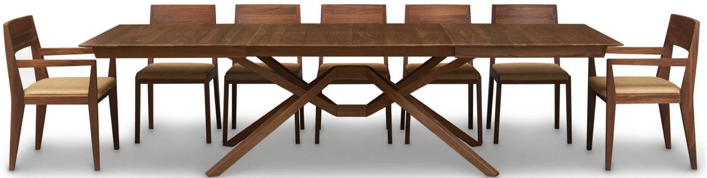
Extension Table with 1 leaf