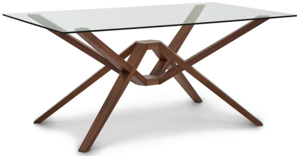
42" x 72" Glass Top Table

Exeter tables are available in a range of glass top sizes highlighting the unique geometry of the table base.