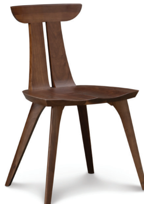
Estelle Side Chair 8-EST-50-04