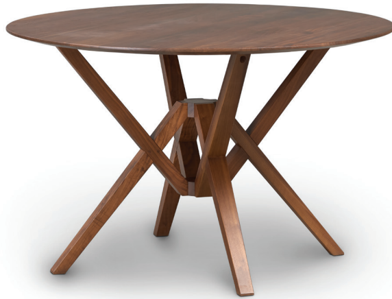
54" Round Table 6-EXR-54-04