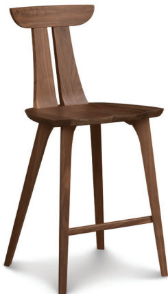
Estelle Counter Stool - seat height 26" 8-EST-60-04