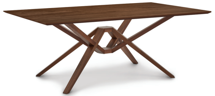
48" x 84" Table 6-EXE-13-04