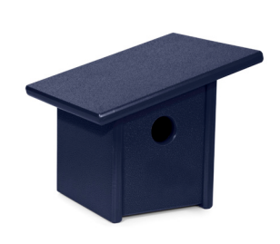
navy blue: AC-PB-NB